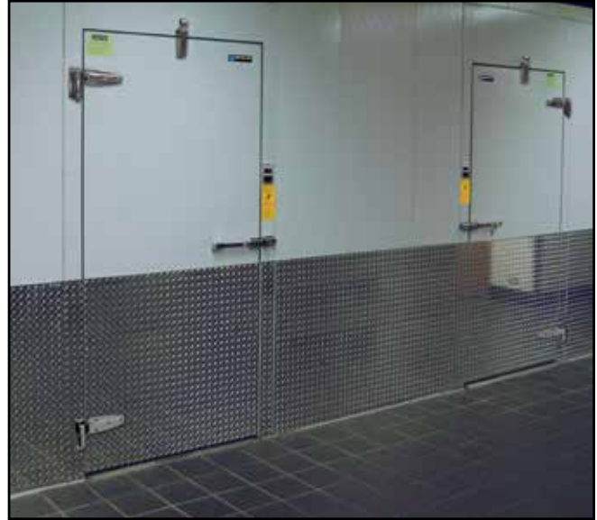
Master-Bilt® ColdSeal Max™ doors can be customized with kickplates and other options to fit your application.

Self-closing, spring-loaded, cam-lift hinges provide an easier, more positive door closure. These hinges are available for either a left- or right-hand opening door.