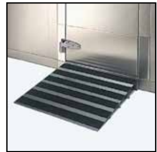
Interior and exterior ramps make it easy to enter the walk-in.