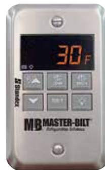
The MBWA-1 is an all-in-one alarm, thermometer and light management system.