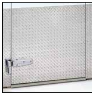
Kick plates protect doors and other panels from dents and scratches.