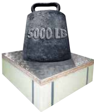
Master-Bilt structural flooring is designed to withstand a pallet jack (or equivalent transporter) with an evenly distributed load of 5000 lbs. over all four wheels.