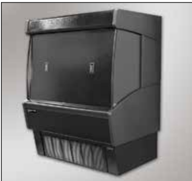
Lockable lift-off security cover (VOAM models)