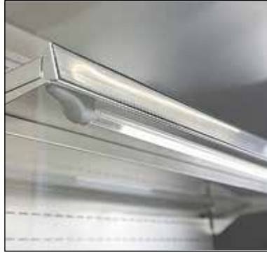
LED lighted shelf kits (VOAM models)