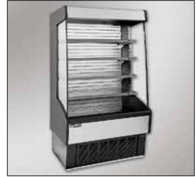
Stainless steel interior and exterior