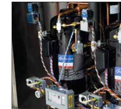
A wide range of compressors is available, including digital scrolls, to better match capacity and budget needs while providing the most energy efficient and environmentally friendly system.