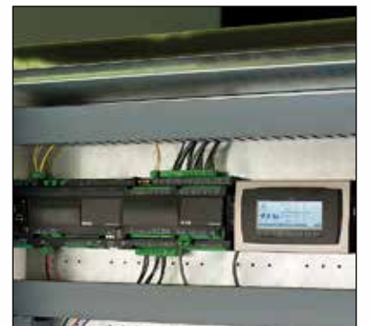
A wide selection of electronic controllers is available to fit most any application. Controllers monitor systems, feature alarms and diagnostics and can interface into existing building controls for remote communications.