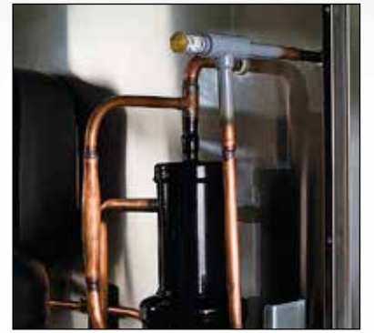
Adjustable head pressure controls protect systems in low ambient conditions.