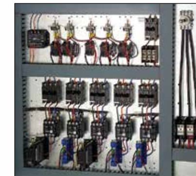
A pre-wired electrical panel with one-point connection allows simple, cost-effective installation and service.