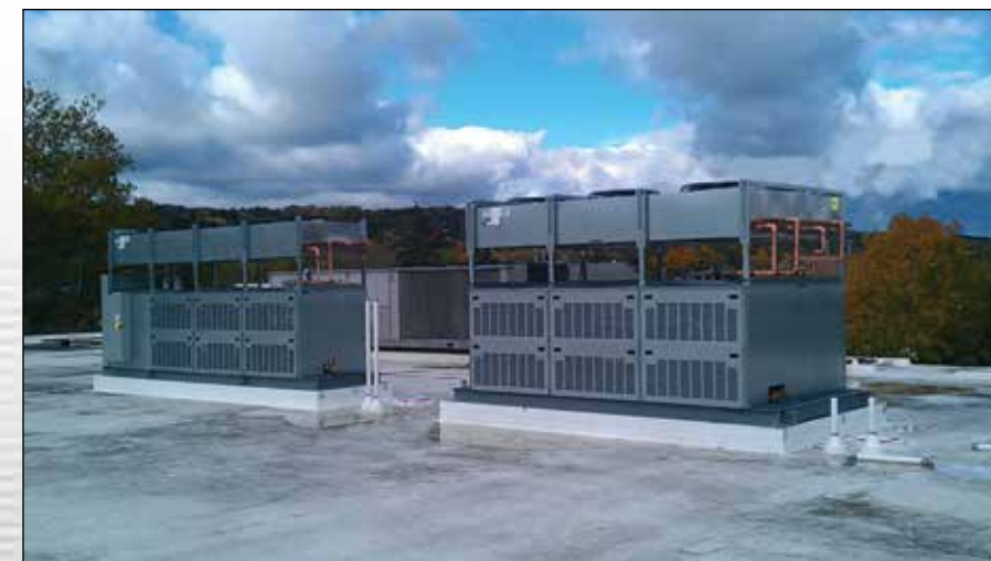
Parallel rack systems feature a standard galvanized steel housing with optional stainless steel available.