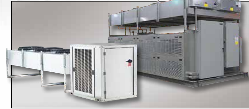
Condenser sections are provided either as a separate unit located remotely or with condensers and compressors on a common frame.