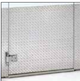
Door & frame kickplates (shipped loose)