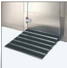
Exterior floor ramps