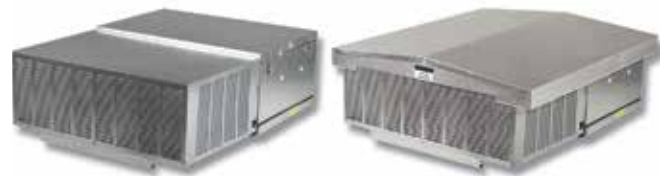
PRS-2 units are available in both indoor and outdoor ceiling mount models. Outdoor models are standard with a crankcase heater, drainline heater, head master and weather hood.