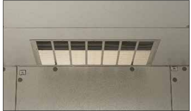
The PRS-2 evaporator grille mounts flush in a standard 4" thick ceiling or wall panel allowing maximum storage space inside the walk-in.

Each refrigeration system is fully assembled, evacuated, charged, run tested and wired at the factory for reliable performance. Adding to that assurance is a warranty covering parts and labor for 18 months and the compressor for a total of five years. Additionally, dedicated medium temp outdoor condensing units meet the DOE requirement of a minimum AWEF rating of 7.61 (Btu/W-h).