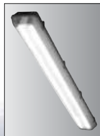
4-foot LED light fixtures (shipped loose)