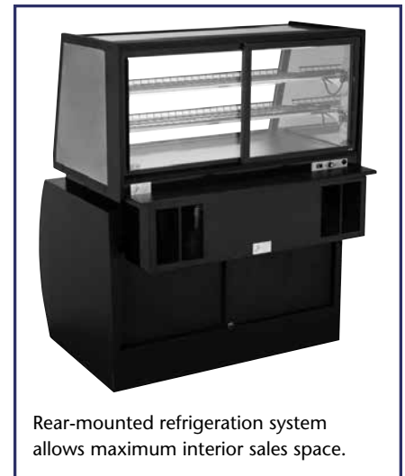
Rear-mounted refrigeration system allows maximum interior sales space.