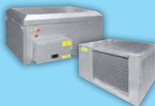
CAPSULE PAK™* REMOTE INDOOR & OUTDOOR Quick-connect systems up to 2 HP