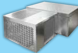
CAPSULE PAK ECO™* SELF-CONTAINED INDOOR ONLY