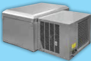
CAPSULE PAK™* SELF-CONTAINED INDOOR & OUTDOOR