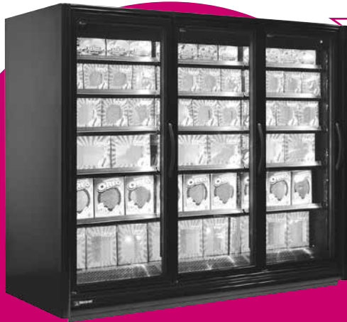
BEL-3-30 (shown with ends installed)