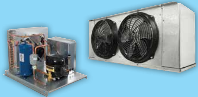
SPLIT-PAK™ REMOTE SYSTEMS INDOOR & OUTDOOR MODELS**