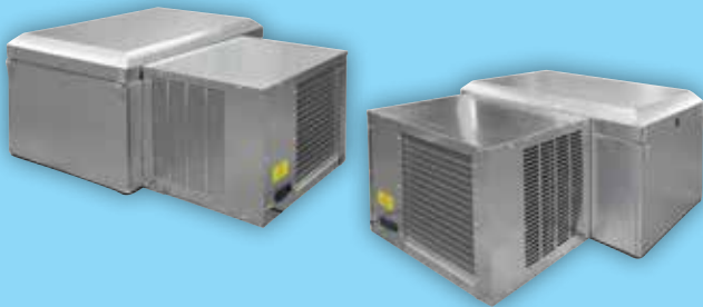
CAPSULE PAK™ SELF-CONTAINED SYSTEMS INDOOR & OUTDOOR MODELS*