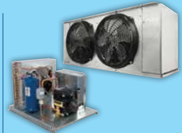
SPLIT-PAK™** REMOTE INDOOR & OUTDOOR Systems ranging from .5 to 6 HP