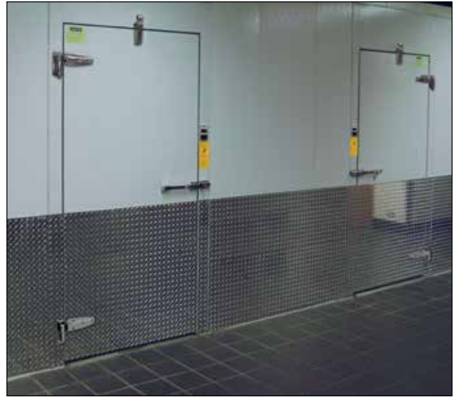
Doors can be customized with kickplates and other options to fit your application.