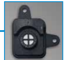
Pre-installed leak sensors for rapid detection