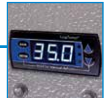
Precise mitigation control through LogiTemp controller system