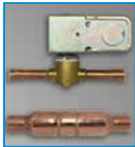
Safety shut-off valves and safety check valves shipped loose for field installation

Other features include a properly sized expansion valve and room thermostat. Energy-efficient EC motors are standard on single-phase models.