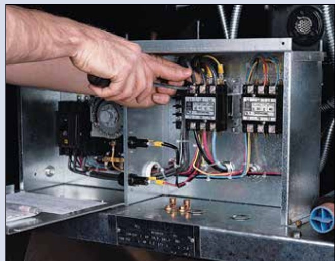
Electrical wiring in Split-Pak A2L condensing units is easily traceable for the installer.

Split-Pak A2L systems are also designed to be easily serviced. Each component is chosen based on its ability to interchange and its availability for installers and service technicians. Individual components are conveniently located on the condensing unit base for easy access.